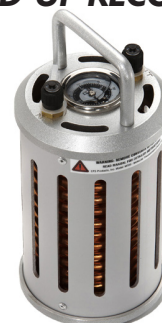
MT69 - SUB COOLER