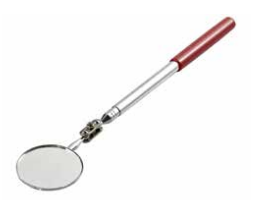
TLMIR 6 Sided Fin Comb