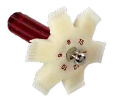
TLFC6 6 Sided Fin Comb